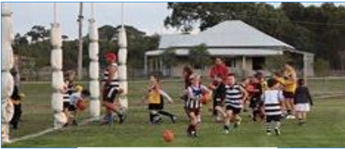
Goal square kids