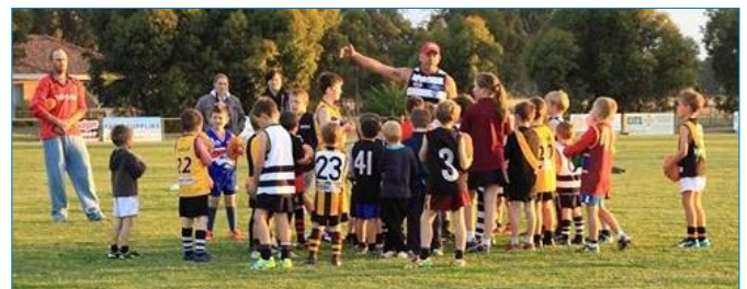
Maws and kids