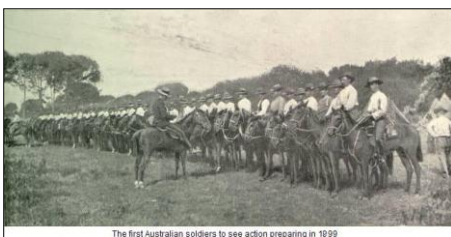
The first Australian soldiers to see action preparing in 1909

This year's Reserve Forces Day Parade will be held on Sunday 1 July at the Shrine of Remembrance from 10.00am until 12.00noon.