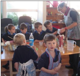
Making scones in the School Kitchen