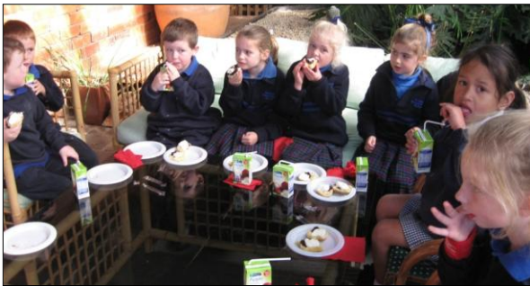
Enjoying our scones which were cooked in the wood fired oven at the Dunkeld Old Bakery