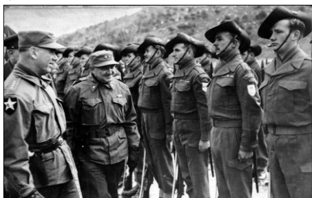
General Van Fleet, General Officer Commanding, 8th US Army (far left) inspects members of the 3rd Battalion (3RAR), when bestowing the Presidential citation in recognition of the Unit's action at Kapyong, Korea. US Major General John W O'Daniel is to Van Fleet's left.

The Korean War is sometimes referred to as the 'forgotten war' because it occurred between two very high-profile conflicts, World War II and the Vietnam War. 1