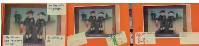
Prep and Year 1 Art

Our students have a respectful and amazing display of their Anzac artwork throughout the school.