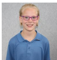
Cadence Year 4/5