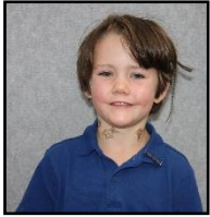
Van – Prep