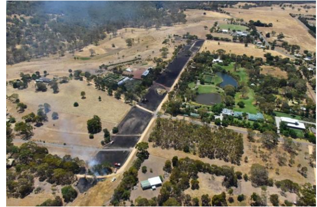
* Aerial shot of a recent fuel reduction burn along Fairburn Street

For further information please contact the Dunkeld Brigade on 0456 966 320.