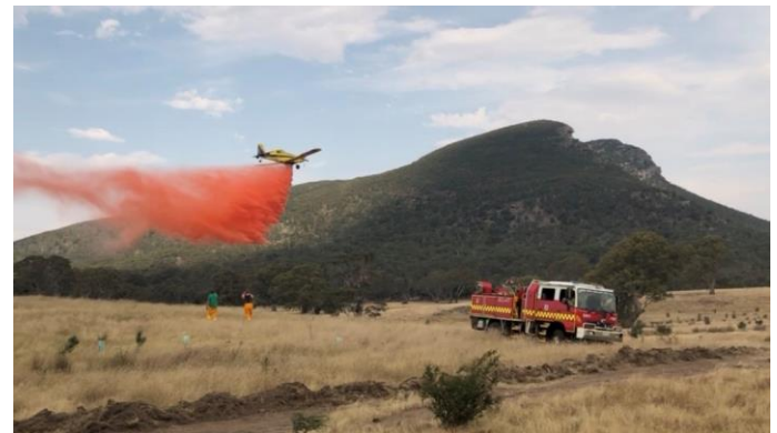
* A water bomber dropping retardant on a containment line at the recent Mount Sturgeon fire