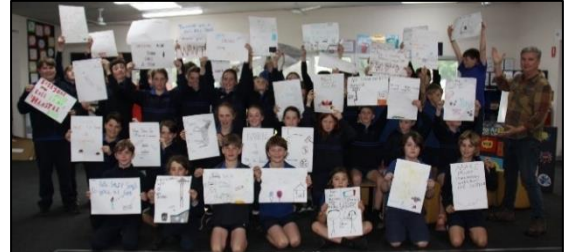
Year 4, 5 and 6 students with Damian Callinan