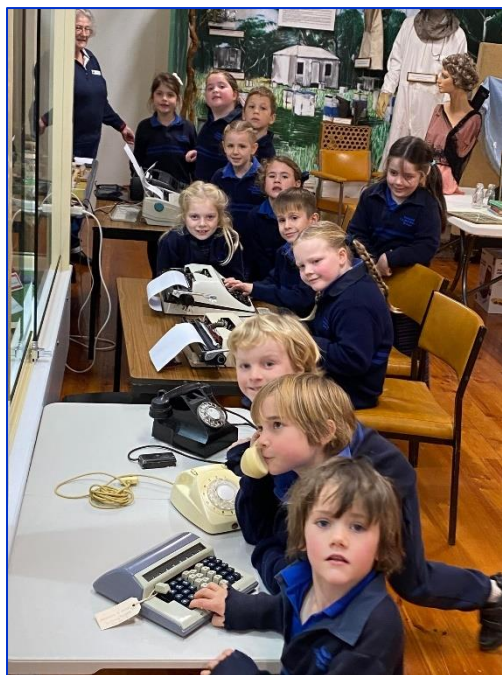
Dunkeld Museum Excursion