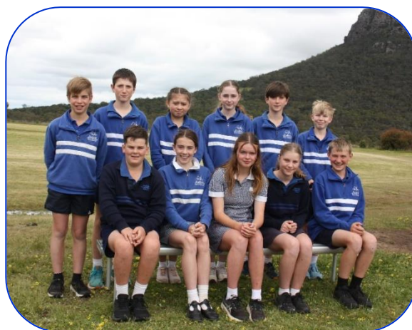
Year 6 Students 2025

The Graduation program is discussed by the Principal and staff, and will remain flexible from year to year.