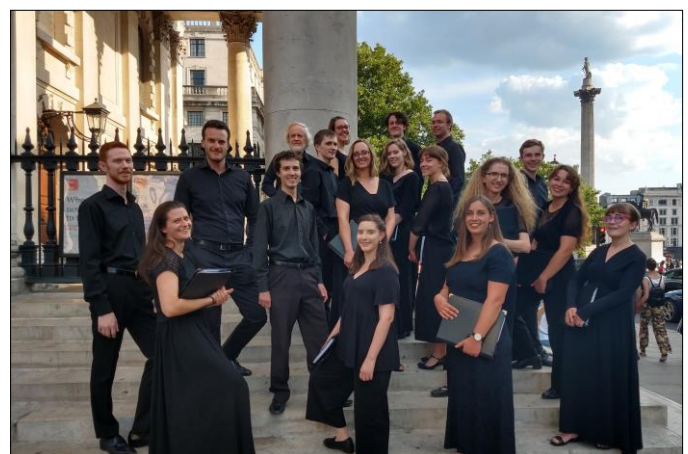
The Australian Chamber Choir at St Martin-in-the-Fields