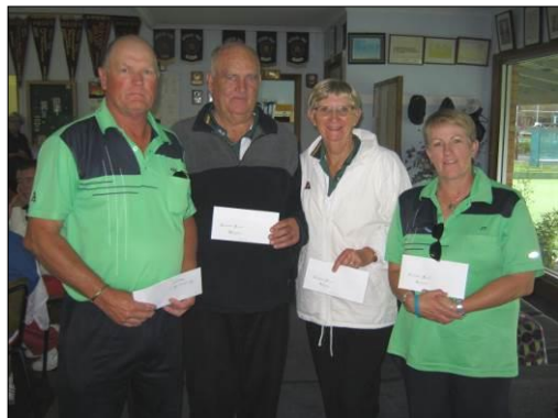
Winners of the Open Fours

This event was fully catered for by our wonderful group of ladies who did a superb job dishing up pre-game nibbles, a wonderful lunch and an impressive arvo tea, catering for 64 bowlers. Well done Ladies, another remarkable effort.