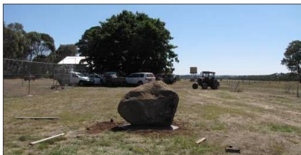
Preparing Rock for dedication plaque - on the old tennis court.