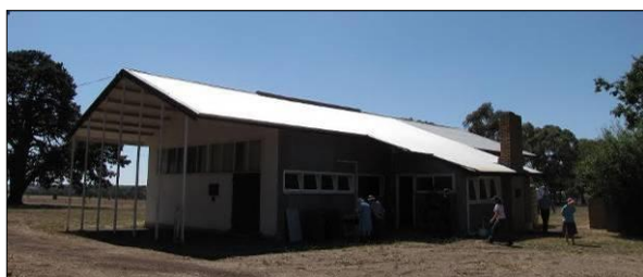
Woodhouse Hall - preparing for BBQ lunch to feed the workers.

A working bee held on Sunday had many locals preparing the way for the celebration with clearing of the plantation planted in 1955, mowing, weed spraying, cleaning and tidying. Also checking archival material and the guest list.