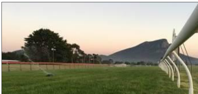
Early morning irrigation also showing new rail.

Racing Victoria has recently completed the installation of a new plastic 'safety' running rail, which brings the track up to current standards for rider and horse safety. Other works completed this year include the installation of two new ticket selling outlets, more improvements to the power grid and some ongoing work to the horse swabbing stall.