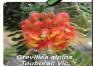
Grevillea alpina, Tooborac Vic.

Australian Ornamental Tubestock & some exotics. Australian Native plants with a good selection of Grevilleas, Eremophilas and Grafted plants.