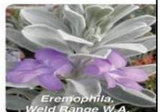
Eremophila, Weld Range W.A.