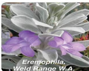
Eremophila, Weld Range W.A.