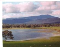
Mirranatwa Landcare Group